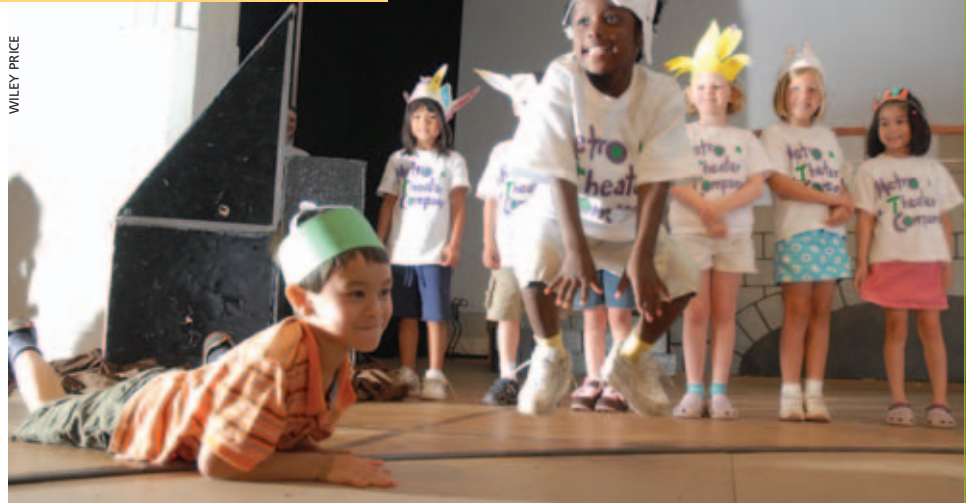
Students share an original story that they staged for family and friends.