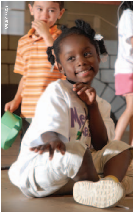
Happy faces are the norm at ArtsINTERsection!

The culmination of this rich week of learning was an Open Mic event held at Johnson Hall at Third Baptist Church. Funding support for the pilot program was provided by the Regional Arts Commission and the Missouri Arts Council.