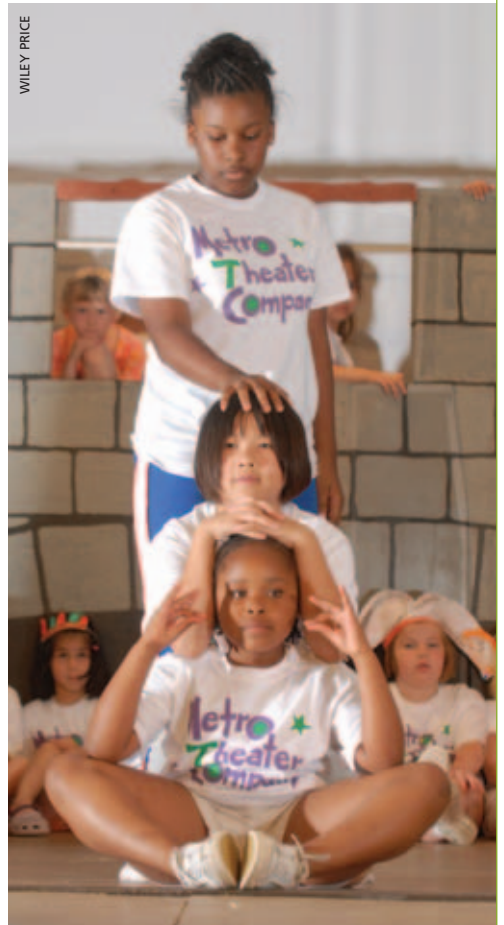
Students share creative movement and a poetry piece they created about Peace.