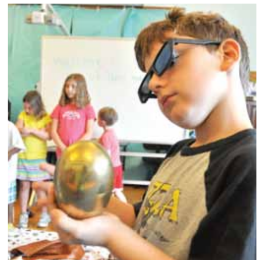
A student at ArtsINTERsection discovers that innovation begins with a new perspective.

Organizations were asked to identify a specific challenge that adversely affects their vitality, and then devise an innovative strategy to address that challenge. The Contemporary Art Museum and the Shakespeare Festival St. Louis are also taking part. The EmcArts New Pathways Program is funded by the Doris Duke Charitable Foundation and the Regional Arts Commission of St. Louis. (More information is available at www.metrotheatercompany.org .)