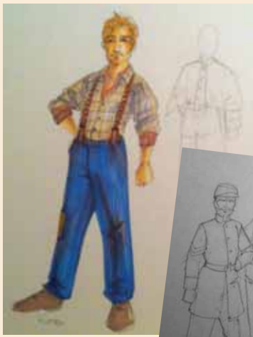
Costume renderings by designer Lou Bird.