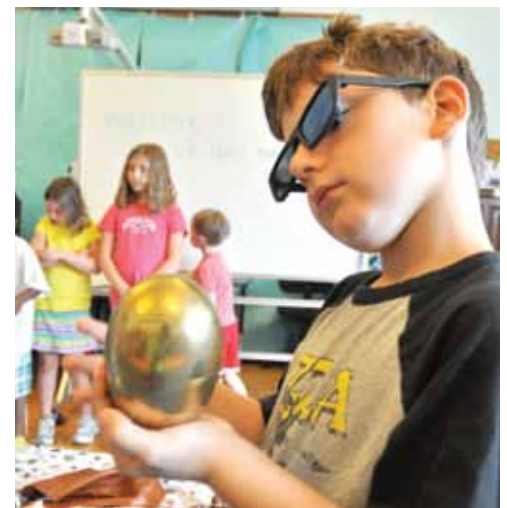
A student at ArtsINTERsection discovers that innovation begins with a new perspective.

Organizations were asked to identify a specific challenge that adversely affects their vitality, and then devise an innovative strategy to address that challenge. The Contemporary Art Museum and the Shakespeare Festival St. Louis are also taking part. The EmcArts New Pathways Program is funded by the Doris Duke Charitable Foundation and the Regional Arts Commission of St. Louis. (More information is available at www.metrotheatercompany.org .)