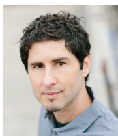
KEYNOTE SPEAKER MATT DE LA PEÑA

A SPECIAL NIGHT TO CELEBRATE AND SUPPORT Metro Theater Company, including a keynote address by New York Times bestselling, Newbery Medal-winning, and Last Stop on Market Street author Matt de la Peña.